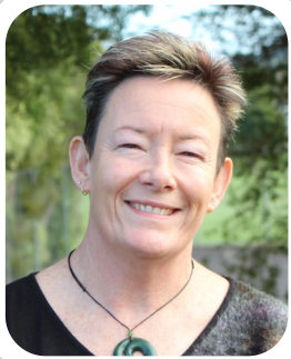
TENA KOUTOU MATUA MA

It's been a very positive and productive term, as you will see as you leaf through the pages of this newsletter. As usual, we finish on a