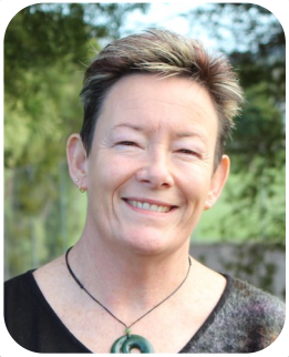
TENA KOUTOU MATUA MA

It's been another busy term at Rodney College with lots of positives. The Education Review Office (ERO) visited in Week 2 and were