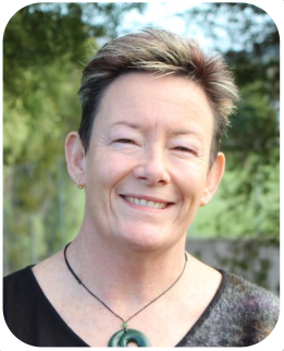
TENA KOUTOU MATUA MA

This newsletter comes to you in Te Wiki o te reo Māori / Maori Language Week, and at a time when the Auckland region remains