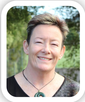
TENA KOUTOU MATUA MA