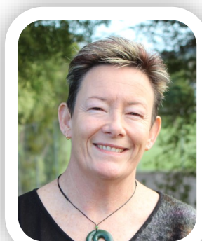
TENA KOUTOU MATUA MA

Along with preparing students for NCEA, Term 4 is a time of acknowledgement and celebration of 2019 senior achievement, sporting, cultural and academic. This began on Wednesday 16 October in our Sports and Cultural Prizegiving . This was an enjoyable night of student entertainment as well as celebration. Then, swiftly on the heels, in Week 3, we celebrated student academic achievements in our Senior Academic Prizegiving . Both were very successful, emotionally charged occasions and it was good to see so many parents and friends of the college there.